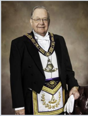
The 175 th Grand Master of Masons in Virginia (2018-2019)