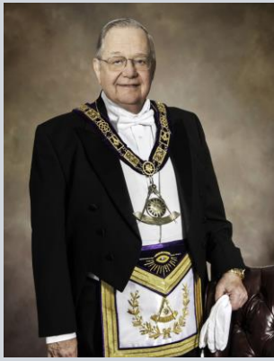
The 175 nd Grand Master of Masons in Virginia (2018-2019)