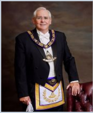
The 170 th Grand Master of Masons in Virginia (2014-2015)