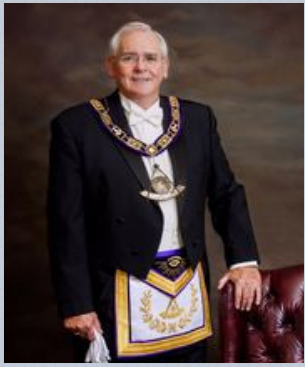
The 170 th Grand Master of Masons in Virginia (2014-2015)