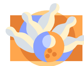
Bowling Night—1/21 Village Lanes 49 Catocin Circle SE, Leesburg, Va. 20175